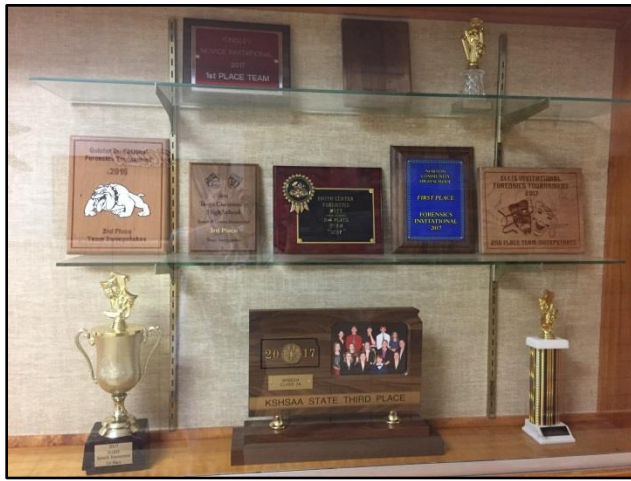
The results of three years of hard work

Thanks to a supportive administration and school board, Forensics has been revived at Plainville High School. While Forensics was offered at PHS in the past, it was only offered as an extracurricular activity, and it was difficult to recruit members for the former team because the school did not offer a Forensics class during the school day. The members, instead, would have practices in the evenings. Many of them were also trying to compete in sports that were in the same season. With competition from track, golf, baseball, and softball for students’ time, practices were not well attended. With that fact on top of the previous coach not having any